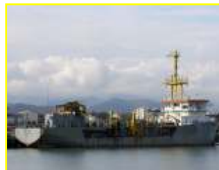
The port of Astara has been integrated with the NSTC