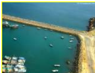
Boats anchored in Chabahar Bay