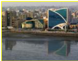
Bandar Abbas is a major port on the NSTC