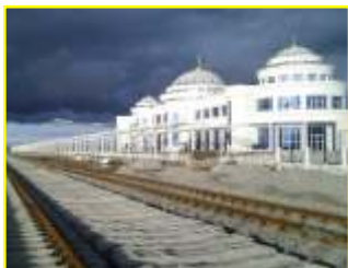
Bereket Railway Station in (Kazandzhik)