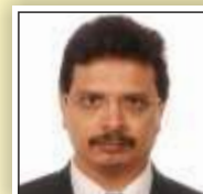
Satya Prasad Sahu Commissioner (IT) Central Board of Excise & Customs, Department of Revenue, Ministry of Finance CBEC