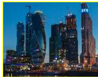
Moscow is the Northern hub on the NSTC