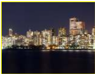
Mumbai is the Southern hub on the NSTC

The INSTC was expanded to include eleven new members, namely: Republic of Azerbaijan, Republic of Armenia, Republic of Kazakhstan, Kyrgyz Republic, Republic of Tajikistan, Republic of Turkey, Republic of Ukraine, Republic of Belarus, Oman, Syria, Bulgaria (Observer).